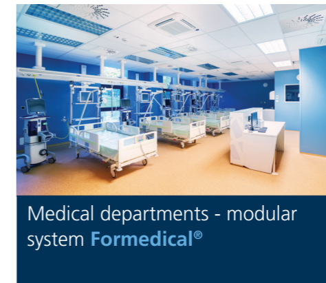
Medical departments - modular system Formedical®