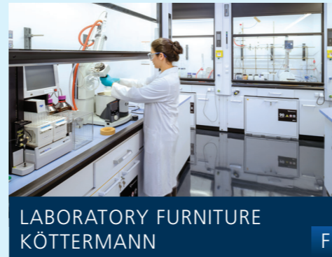
LABORATORY FURNITURE KÖTTERMANN