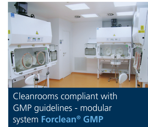
Cleanrooms compliant with GMP guidelines - modular system Forclean® GMP